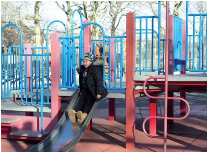
Pat Parlato Playground, Manhattan Beach

Parks are an essential city service. They are the barometers of our city. From Flatbush to Flushing and Morrisania to Midtown, parks are the front and backyards of all New Yorkers. Well-maintained and designed parks offer recreation and solace, improve property values, reduce crime, and contribute to healthy communities.