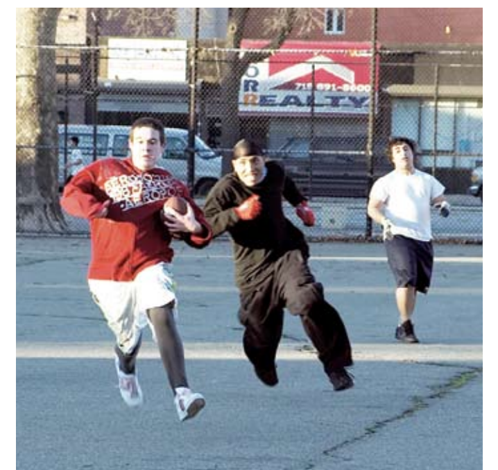
Bill Brown Memorial Playground, Sheepshead Bay