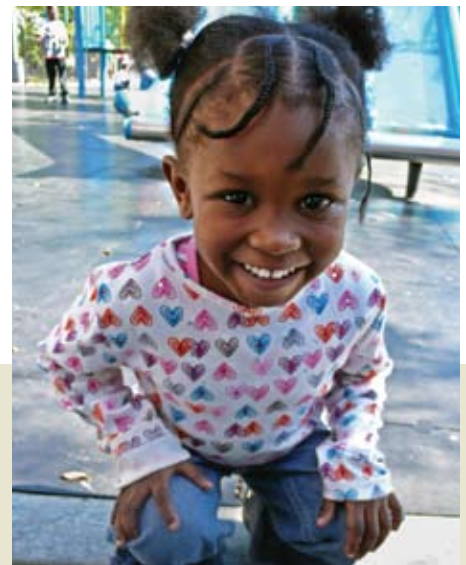
Top: Madison Square Park, Manhattan Middle: Flushing Meadows-Corona Park, Queens Above: Vidalia Park, Bronx