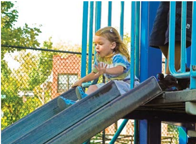
Sarsfield Playground, Flatlands

Parks are an essential city service. They are the barometers of our city. From Flatbush to Flushing and Morrisania to Midtown, parks are the front and backyards of all New Yorkers. Well-maintained and designed parks offer recreation and solace, improve property values, reduce crime, and contribute to healthy communities.