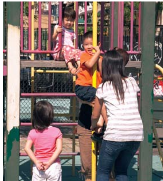
At left: Herbert Von King Park, Bedford Stuyvesant Above: Lieutenant Joseph Petrosino Park, New Utrecht