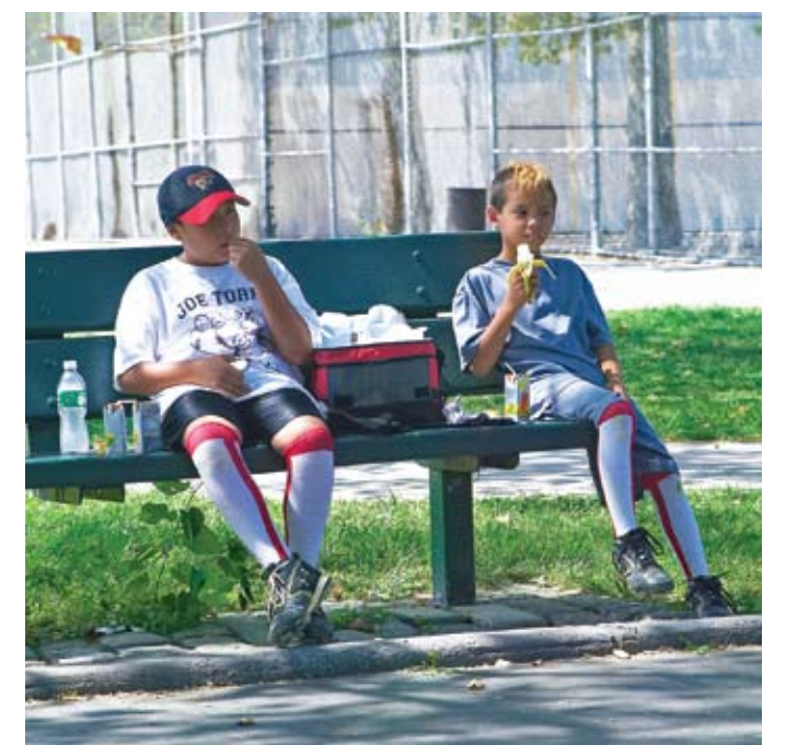
Lenape Playground, Gerritsen Beach