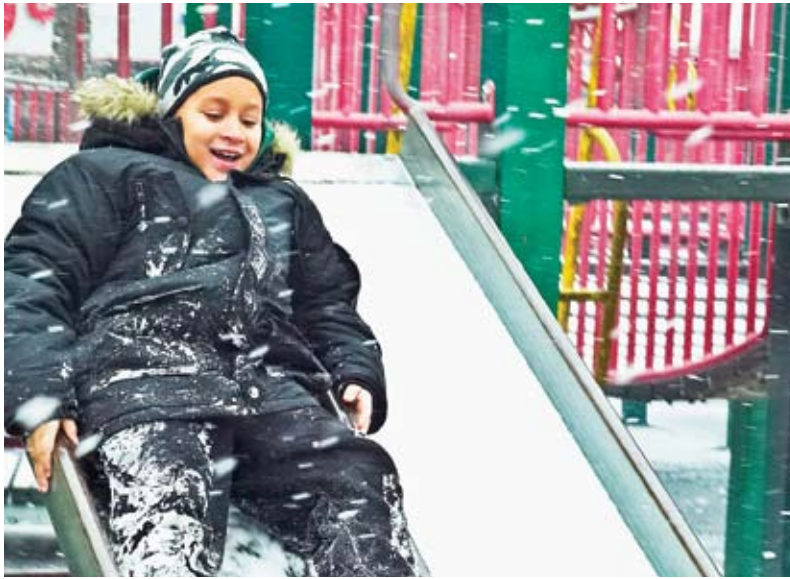
Nostrand Playground, Flatbush

Parks are an essential city service. They are the barometers of our city. From Flatbush to Flushing and Morrisania to Midtown, parks are the front and backyards of all New Yorkers. Well-maintained and designed parks offer recreation and solace, improve property values, reduce crime, and contribute to healthy communities.