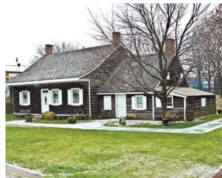
M. Fidler Wyckoff House Park, East Flatbush