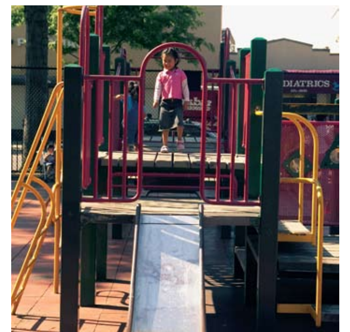
Garibaldi Playground, Bensonhurst