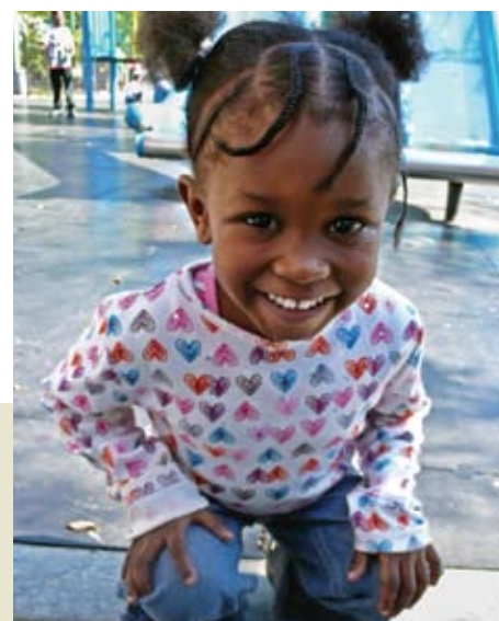
Top: Madison Square Park, Manhattan Middle: Flushing Meadows-Corona Park, Queens Above: Vidalia Park, Bronx