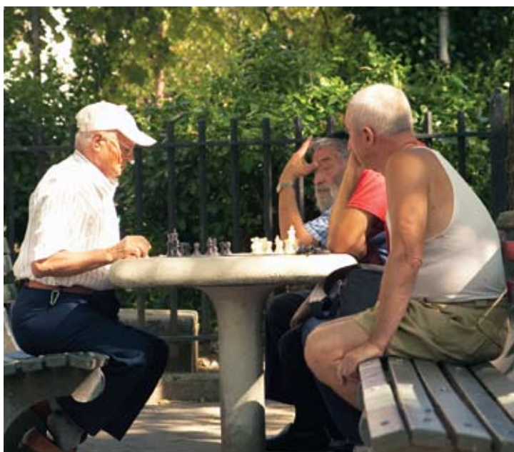
Milestone Park, Bensonhurst