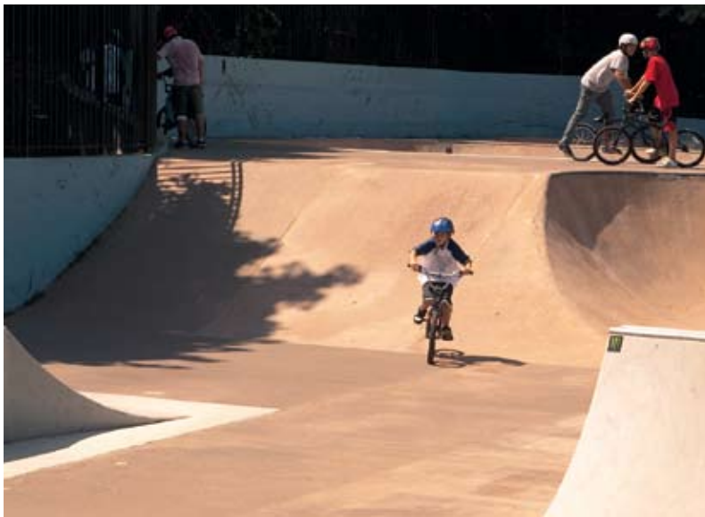
Owls Head Park, Bay Ridge

Parks are an essential city service. They are the barometers of our city. From Flatbush to Flushing and Morrisania to Midtown, parks are the front and backyards of all New Yorkers. Well-maintained and designed parks offer recreation and solace, improve property values, reduce crime, and contribute to healthy communities.