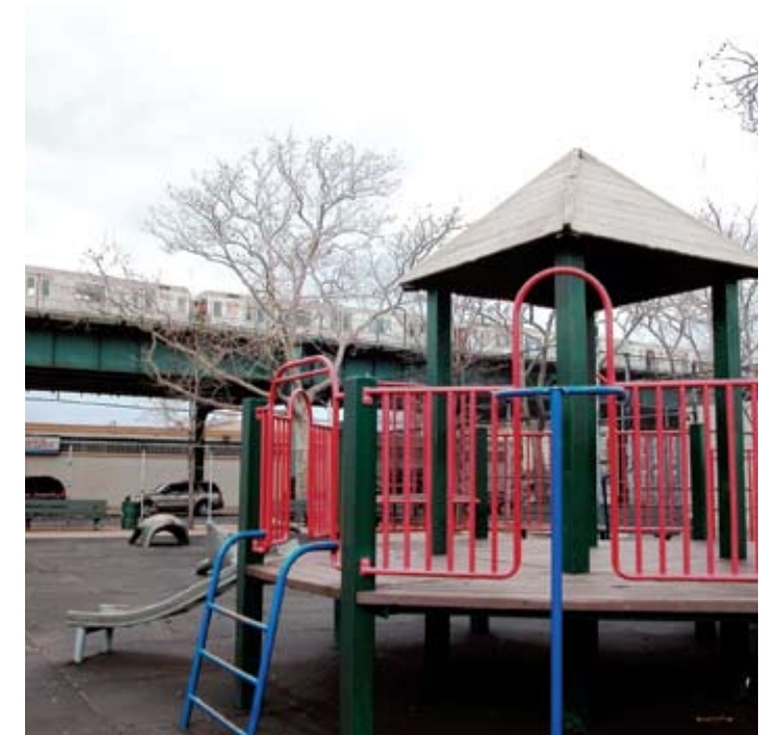
Schenk Playground, East New York