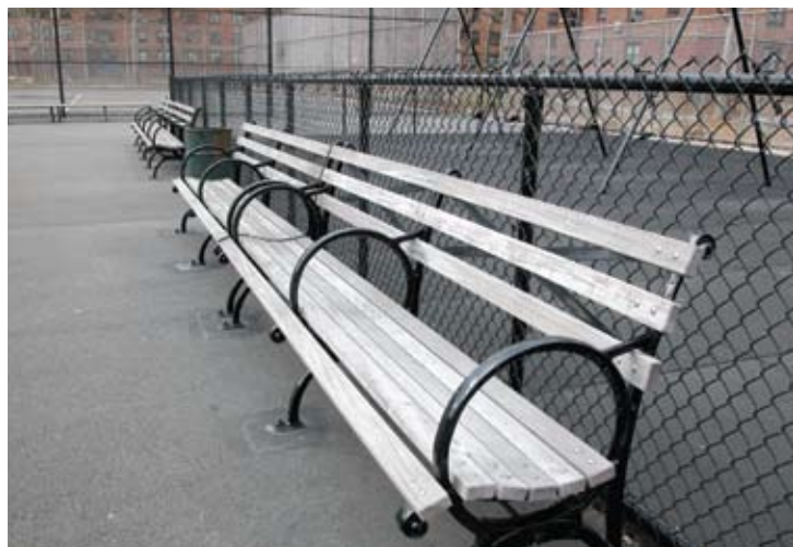
Pink Playground, City Line