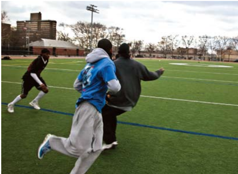
Linden Park, New Lots

Parks are an essential city service. They are the barometers of our city. From Flatbush to Flushing and Morrisania to Midtown, parks are the front and backyards of all New Yorkers. Well-maintained and designed parks offer recreation and solace, improve property values, reduce crime, and contribute to healthy communities.