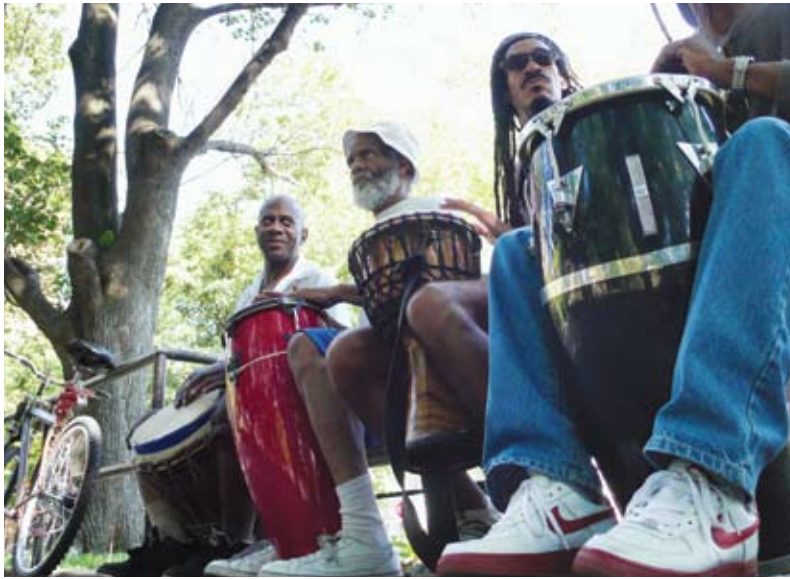
Saratoga Square Park, Bedford-Stuyvesant

Parks are an essential city service. They are the barometers of our city. From Flatbush to Flushing and Morrisania to Midtown, parks are the front and backyards of all New Yorkers. Well-maintained and designed parks offer recreation and solace, improve property values, reduce crime, and contribute to healthy communities.