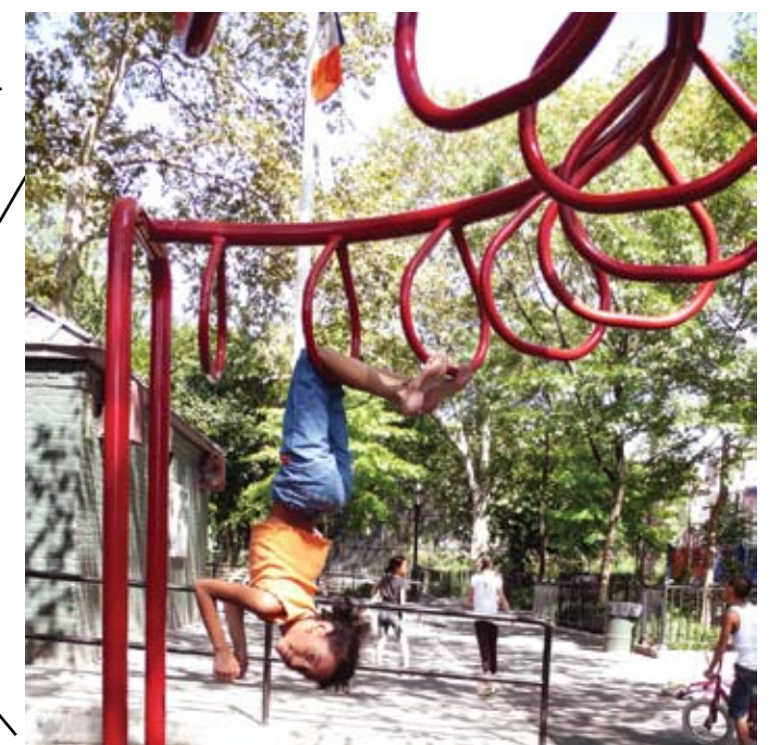
Marion-Hopkinson Playground, Ocean Hill