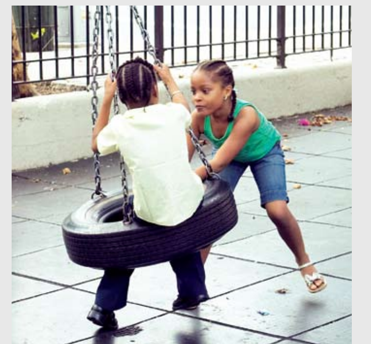
Wingate Park, Wingate

DATA SOURCES All data is from 2008 unless noted. "Citywide": Parks by the Numbers - NYC Department of Parks and Recreation (DPR); Budget chart - Adopted Budgets, NYC Office of Management and Budget (OMB), FY 1989-2009; Preliminary Budget, OMB, FY 2010. "By the borough": PIP Ratings, By the numbers & Staffing - DPR; Trees - "Trees Count!" Street Tree Census report, 2005-2006; DPR. This page: Population - Census2000; Language access - Infoshare.org; Civic engagement - NYC Board of Elections and NYC Department of Information Technology and Telecommunications (DOITT), FY 2008; Park resources and PIP ratings - DPR; Community Gardens - Council on the Environment of NYC; Vacant land - MapPLUTO copyrighted by the New York City Department of Planning, BYTES of the BIG APPLE; Health - NYS Department of Health, 2006 via Infoshare.org; Education - NYC and NYS Departments of Education, 2007-2008, analysis by the Annenberg Foundation.