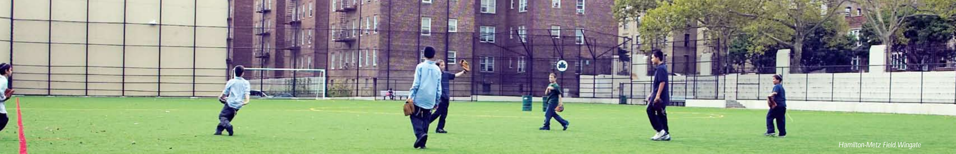
Hamilton-Metz Field, Wingate