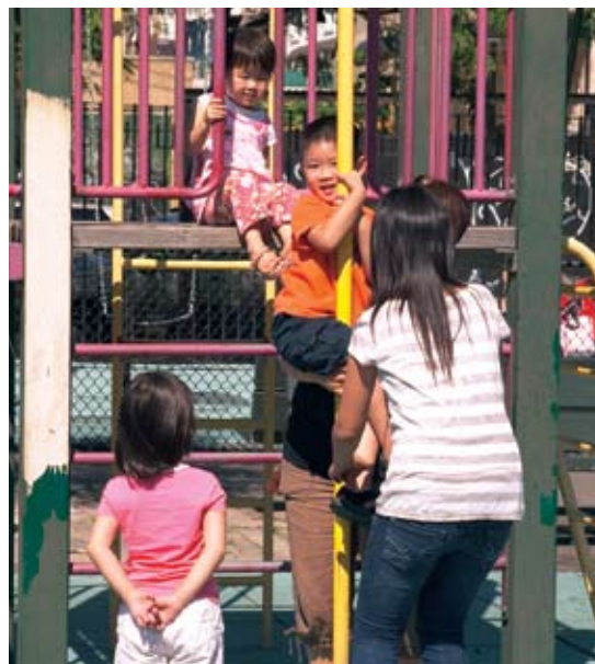
At left: Herbert Von King Park, Bedford Stuyvesant Above: Lieutenant Joseph Petrosino Park, New Utrecht