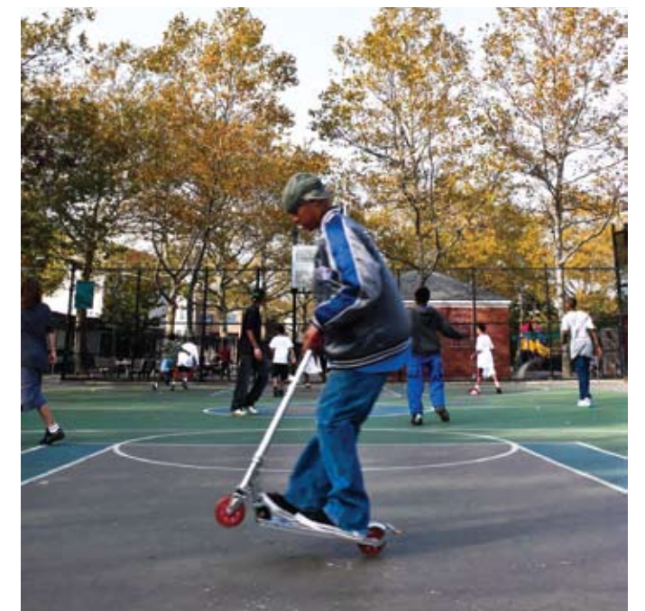
Greenwood Playground, Windsor Terrace