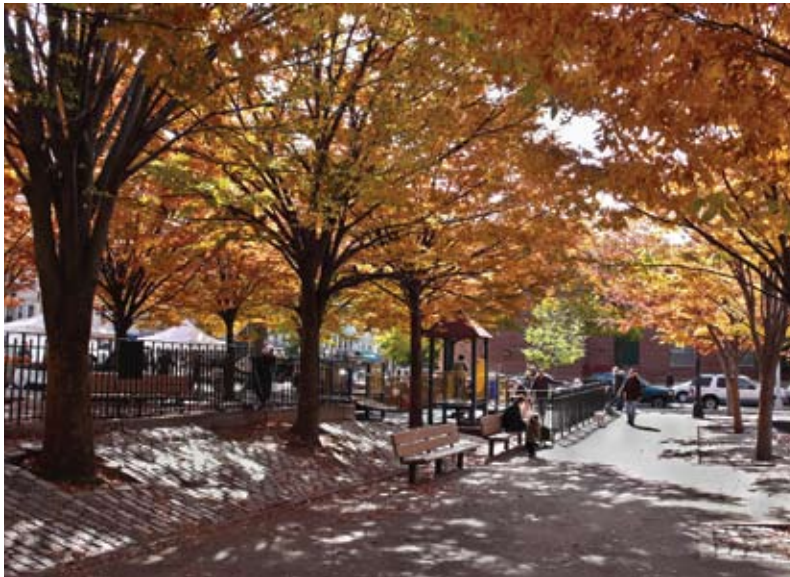
J.J. Byrne Memorial Park, Park Slope

Parks are an essential city service. They are the barometers of our city. From Flatbush to Flushing and Morrisania to Midtown, parks are the front and backyards of all New Yorkers. Well-maintained and designed parks offer recreation and solace, improve property values, reduce crime, and contribute to healthy communities.