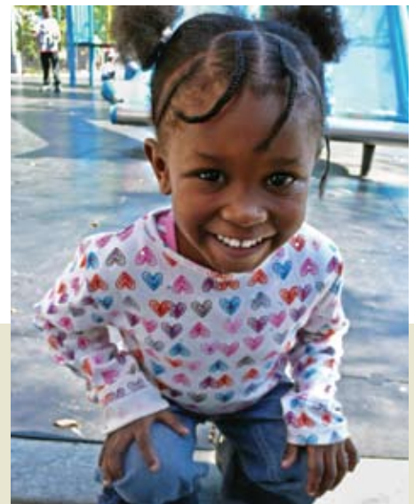
Top: Madison Square Park, Manhattan Middle: Flushing Meadows-Corona Park, Queens Above: Vidalia Park, Bronx