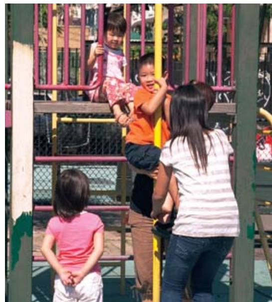
At left: Herbert Von King Park, Bedford Stuyvesant Above: Lieutenant Joseph Petrosino Park, New Utrecht