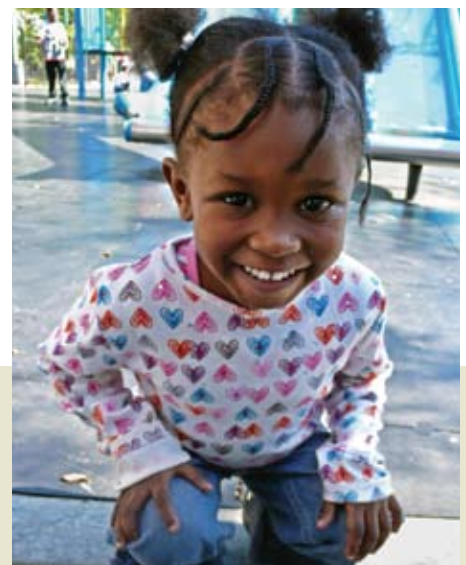
Top: Madison Square Park, Manhattan Middle: Flushing Meadows-Corona Park, Queens Above: Vidalia Park, Bronx