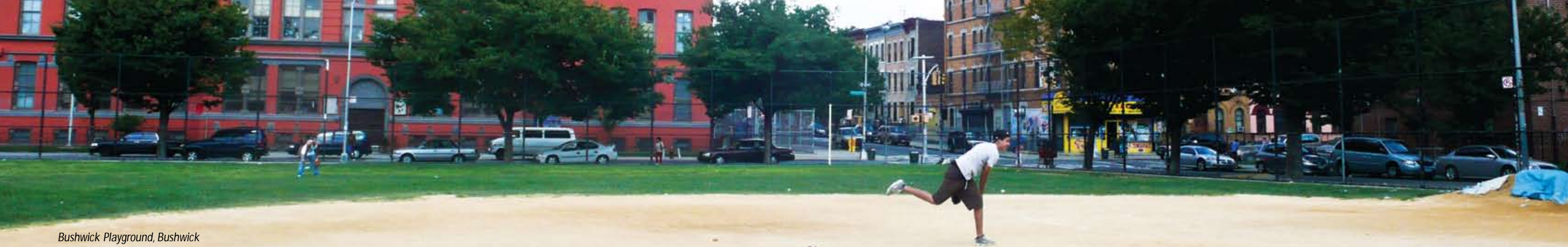
Bushwick Playground, Bushwick