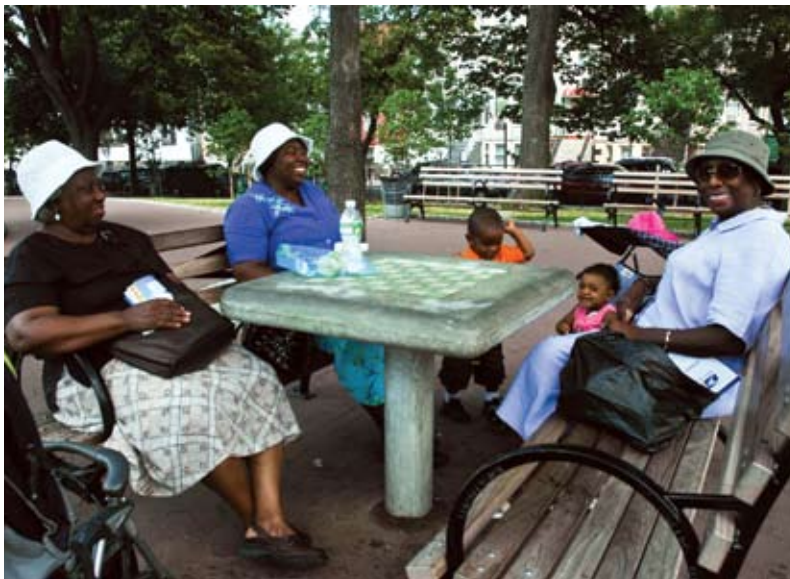
Irving Square Park, Bushwick

Parks are an essential city service. They are the barometers of our city. From Flatbush to Flushing and Morrisania to Midtown, parks are the front and backyards of all New Yorkers. Well-maintained and designed parks offer recreation and solace, improve property values, reduce crime, and contribute to healthy communities.