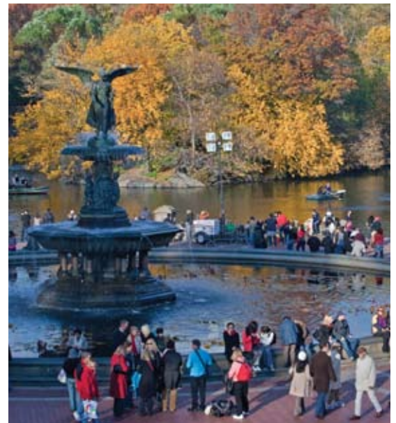
Top: Breininger Playground, Queens Above: Central Park, Manhattan