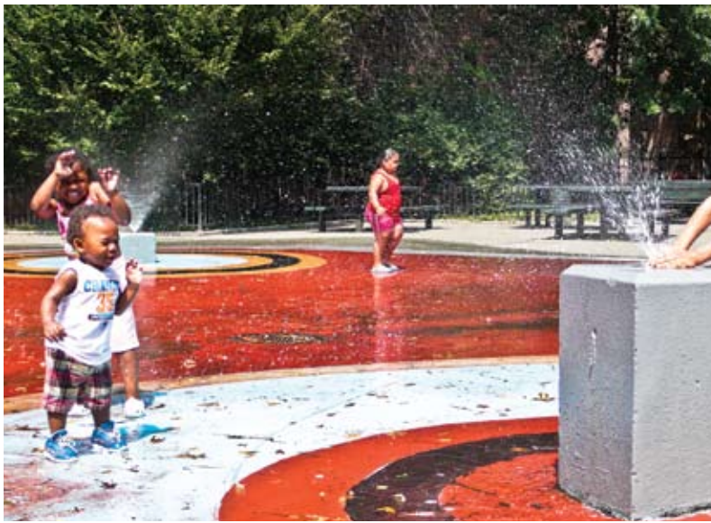
Marcy Playground, Bedford-Stuyvesant

Parks are an essential city service. They are the barometers of our city. From Flatbush to Flushing and Morrisania to Midtown, parks are the front and backyards of all New Yorkers. Well-maintained and designed parks offer recreation and solace, improve property values, reduce crime, and contribute to healthy communities.