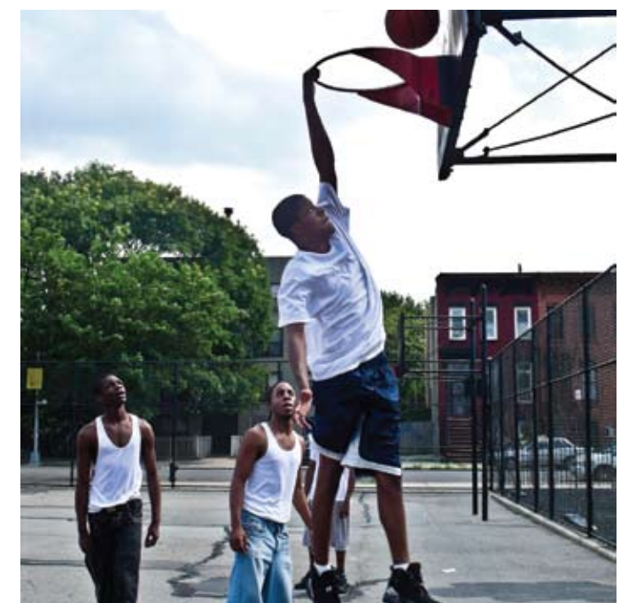
Eleanor Roosevelt Playground, Bedford-Stuyvesant