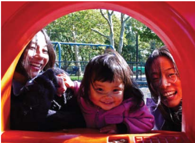
Cooper Park, East Williamsburg

Parks are an essential city service. They are the barometers of our city. From Flatbush to Flushing and Morrisania to Midtown, parks are the front and backyards of all New Yorkers. Well-maintained and designed parks offer recreation and solace, improve property values, reduce crime, and contribute to healthy communities.