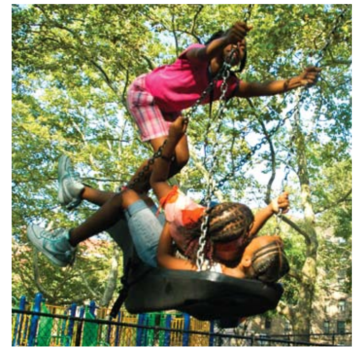
Vernon Playground, Queensbridge