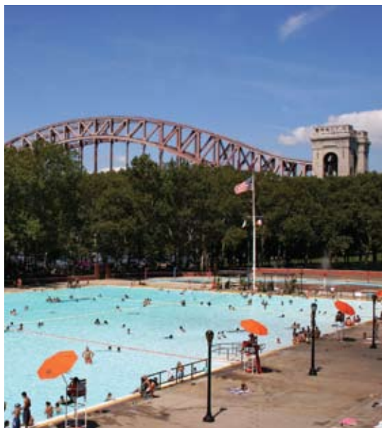
At left: Austin Playground, Jamaica Above: Astoria Park, Astoria