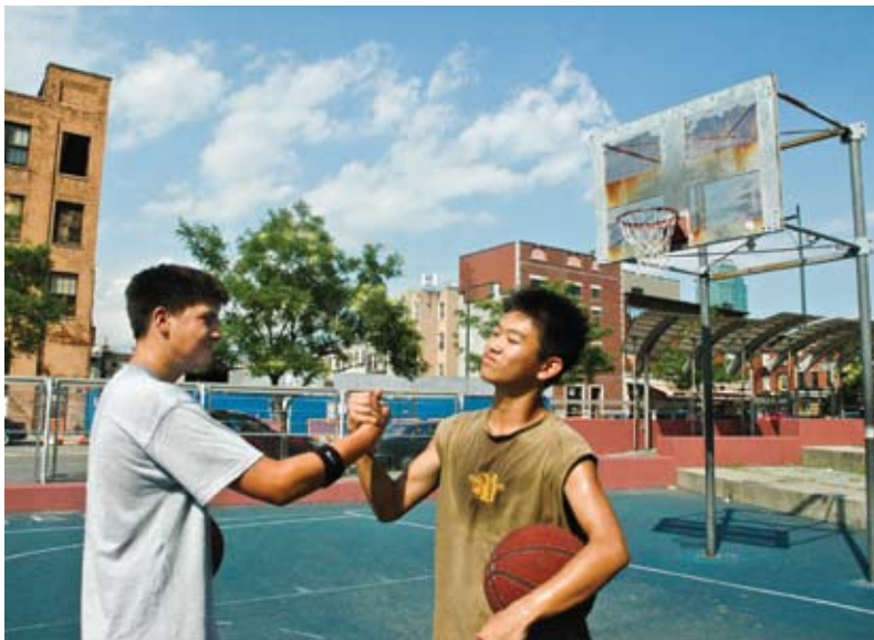
Hunter's Point Park, Hunter's Point

Parks are an essential city service. They are the barometers of our city. From Flatbush to Flushing and Morrisania to Midtown, parks are the front and backyards of all New Yorkers. Well-maintained and designed parks offer recreation and solace, improve property values, reduce crime, and contribute to healthy communities.