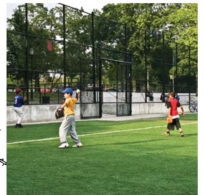
Hinton Park, Corona