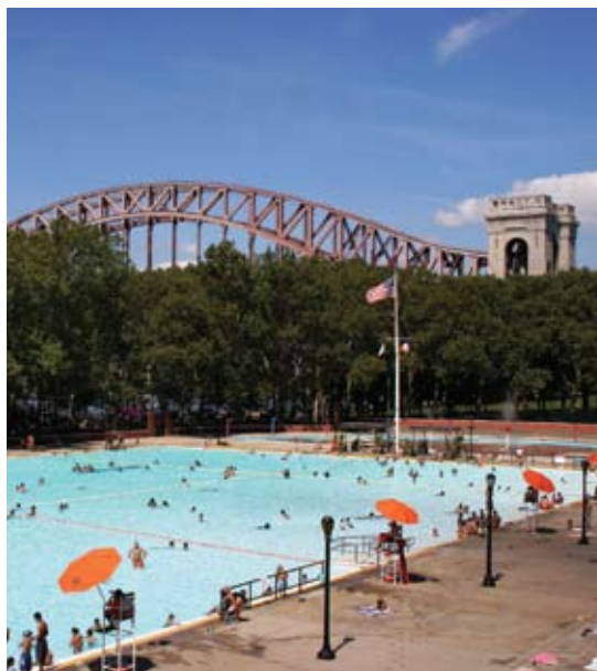
At left: Austin Playground, Jamaica Above: Astoria Park, Astoria