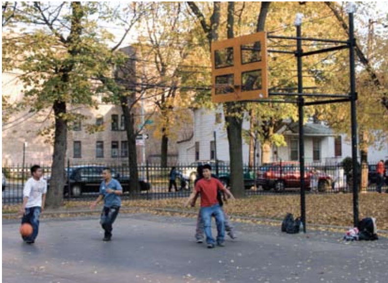
Park of the Americas, Corona

Parks are an essential city service. They are the barometers of our city. From Flatbush to Flushing and Morrisania to Midtown, parks are the front and backyards of all New Yorkers. Well-maintained and designed parks offer recreation and solace, improve property values, reduce crime, and contribute to healthy communities.