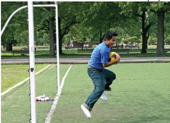
Flushing Meadows-Corona Park, Corona