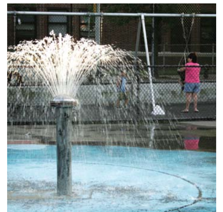
Loreto Playground, Morris Park