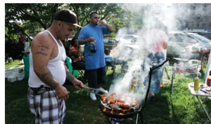
Pelham Bay Park, Pelham Bay