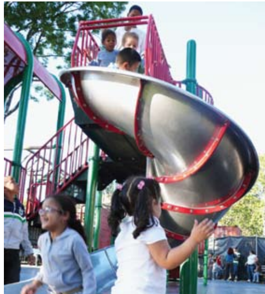
At left: Van Cortlandt Park, Van Cortlandt Village Above: Poe Park, Fordham