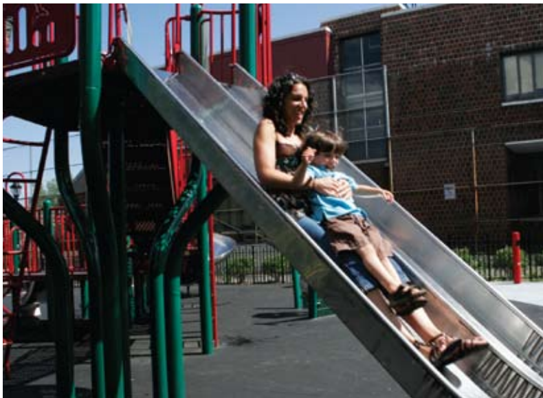
Ambrosini Field, City Island

Parks are an essential city service. They are the barometers of our city. From Flatbush to Flushing and Morrisania to Midtown, parks are the front and backyards of all New Yorkers. Well-maintained and designed parks offer recreation and solace, improve property values, reduce crime, and contribute to healthy communities.