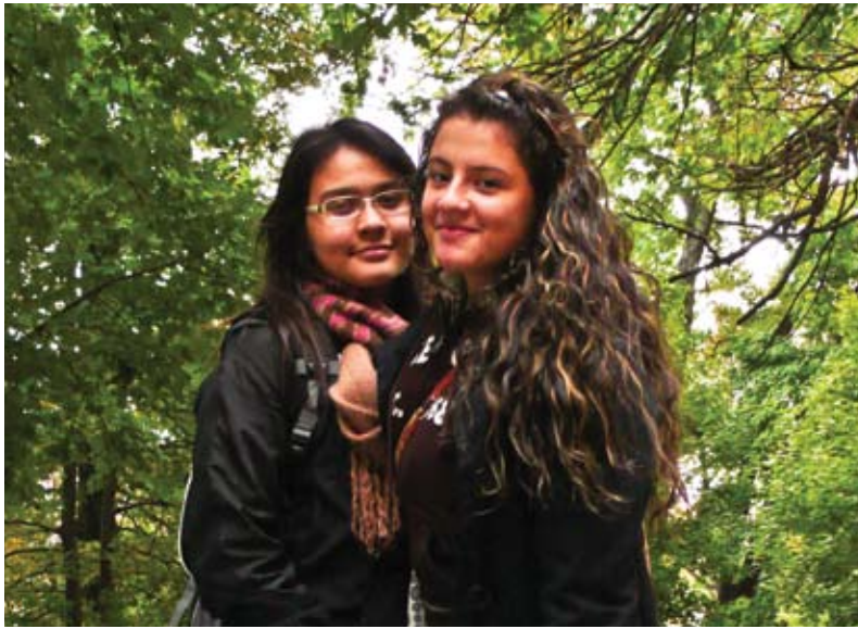
Ewen Park, Spuyten Duyvil

Parks are an essential city service. They are the barometers of our city. From Flatbush to Flushing and Morrisania to Midtown, parks are the front and backyards of all New Yorkers. Well-maintained and designed parks offer recreation and solace, improve property values, reduce crime, and contribute to healthy communities.