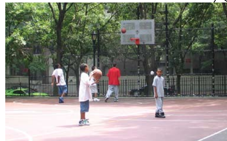
Tompkins Square Park, East Village