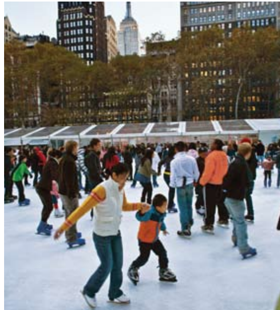
At left: Bennett Park, Washington Heights Above: Bryant Park, Midtown