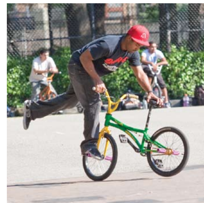
Tompkins Square Park, East Village