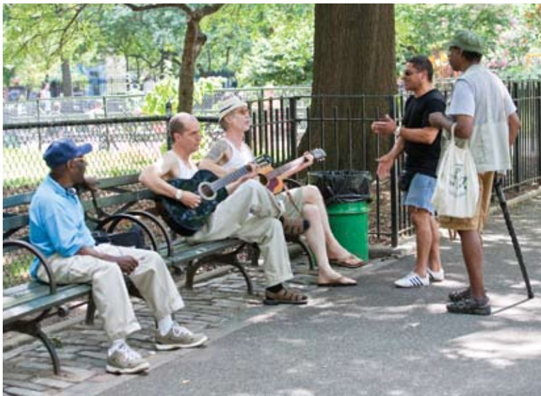
Tompkins Square Park, East Village

Parks are an essential city service. They are the barometers of our city. From Flatbush to Flushing and Morrisania to Midtown, parks are the front and backyards of all New Yorkers. Well-maintained and designed parks offer recreation and solace, improve property values, reduce crime, and contribute to healthy communities.