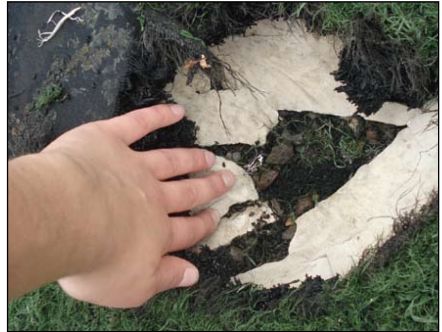
Exposed drainage system in Sternberg Park, Williamsburg, Brooklyn

In 2008, 28% of the fields inspected experienced missing or detached sections of artificial turf, and by 2009 that percentage had increased to 33%.