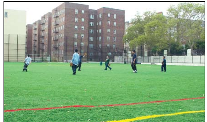
Alexander-Hamilton Metz Memorial Field, Prospect Lefferts Gardens, Brooklyn

All of these issues led NY4P to focus our 2008 and 2009 inspections on artificial turf.