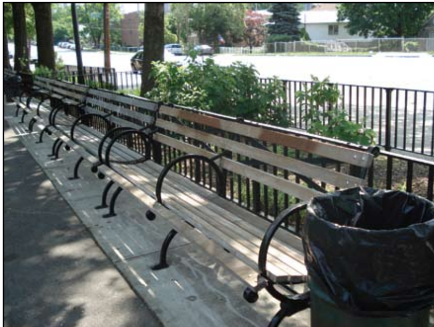
Well-maintained benches in Haffen Park, Baychester, Bronx

These strong performances and improvements indicate a successful focus on maintenance by the Department of Parks and Recreation.