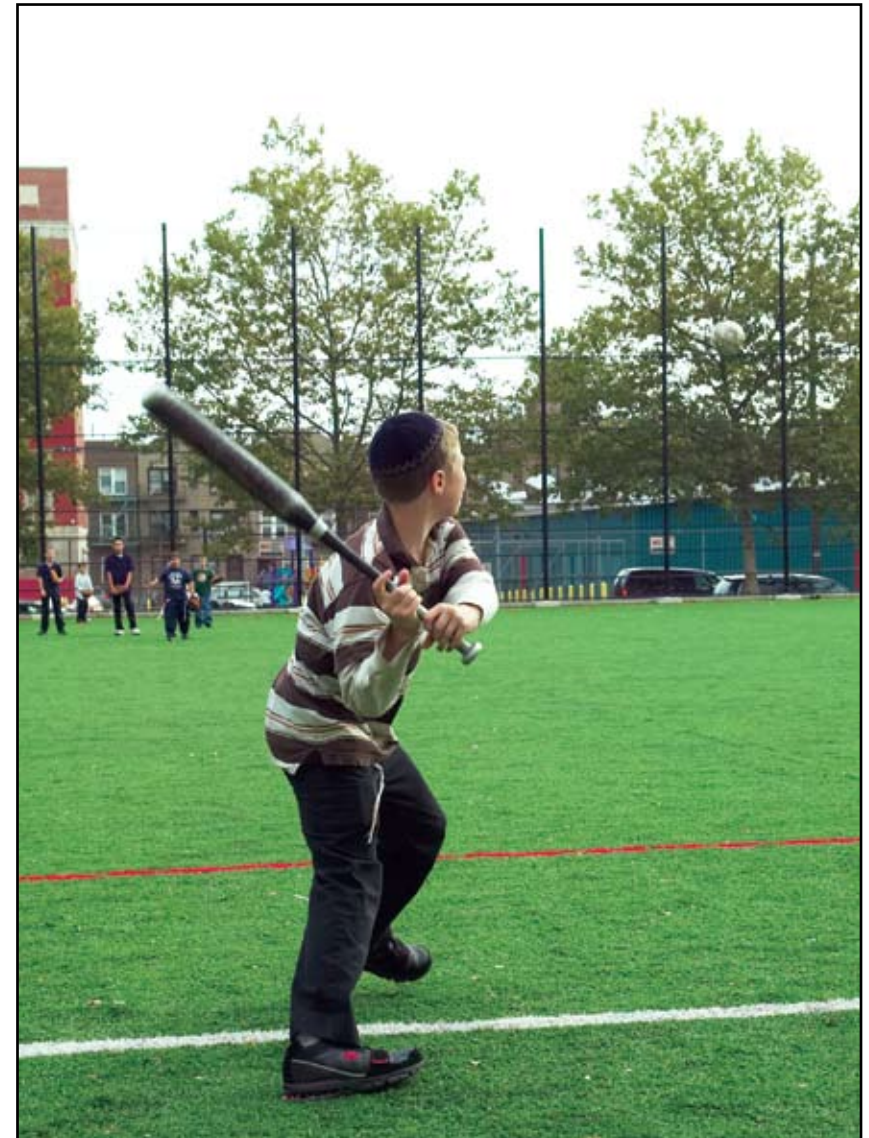
Alexander Hamilton-Metz Memorial Field, Prospect Lefferts Gardens, Brooklyn