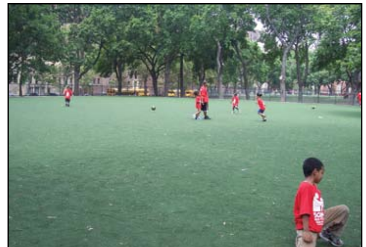
John Mullaly Park, Concourse, Bronx

Between New York City's continued population growth and public health concerns over the climbing rates of childhood obesity and diabetes, the demand for recreation in New York City parks has never been stronger. In response to the heightened demand for athletic fields and an increasingly tight maintenance budget, the Parks Department has installed 94 1 artificial turf fields and 17 artificial turf play areas across New York City since 1998. In addition to DPR's capital plans, Mayor Bloomberg's PlaNYC 2030 plan calls for replacing 21 asphalt fields with multi-purpose artificial turf by 2013 2 . Proponents of artificial turf point to the following advantages: year-round and all-weather play due