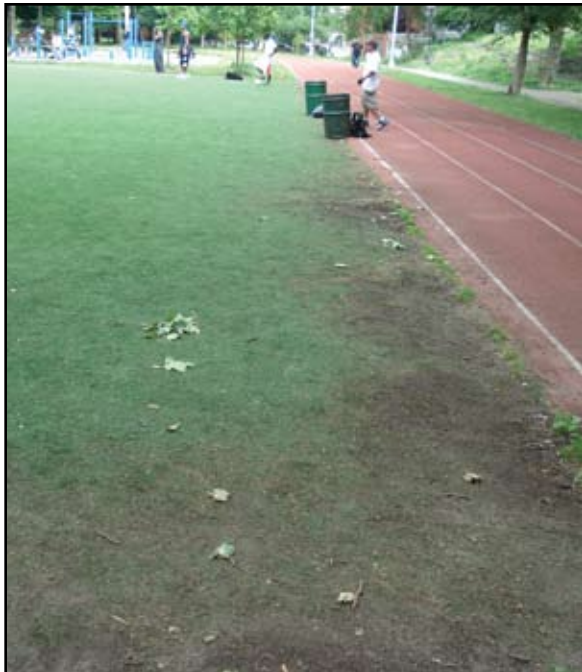
Worn and compacted area, St. Mary's Park, Mott Haven, Bronx

The poorest performing indicator in the survey was the condition of turf blades, which declined significantly between the two summers. In 2008, 39% of the fields were impacted by areas of worn blades, and by the summer of 2009 that percentage had risen to 52%. Worn areas have lost most of their turf blades, which increases the temperature above the field, reduces traction and exposes crumb rubber infill or other base material. These conditions increase opportunity for injury and impede play. Over the long term, the deterioration can lead to holes, sometimes exposing the drainage system beneath the turf surface, which can pose danger to park users.