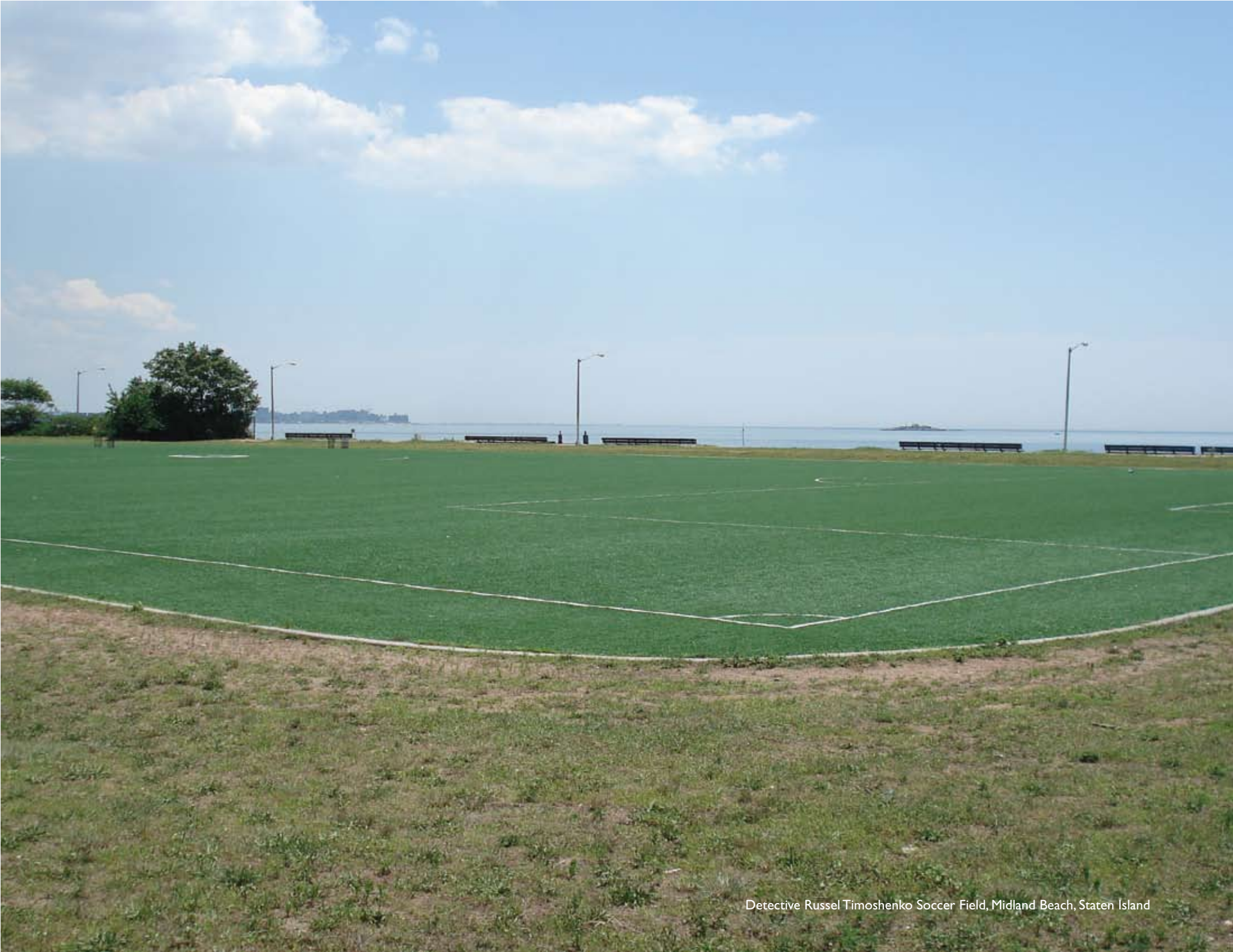
Detective Russel Timoshenko Soccer Field, Midland Beach, Staten Island