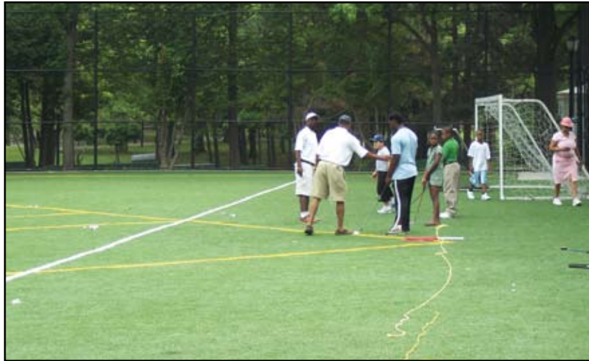
Haffen Park, Baychester, Bronx

Haffen Park in the Bronx scored a 100% in both 2008 and 2009. In 2008, nine fields scored 100%, and in 2009, five fields scored 100%.