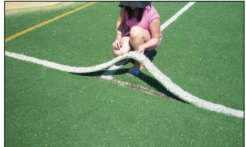
A loose seam in Fort Hamilton Park, Bay Ridge, Brooklyn

In 2008, seven parks scored an F. All seven scored poorly for loose seams; five were found to have significant missing sections of turf; and four out of seven scored poorly for worn areas of turf. Five of these seven fields also failed in 2009. In 2009, eleven fields failed. Eight out of eleven scored poorly for loose seams. Eight out of eleven were found to have significant missing sections of turf, seven out of eleven scored poorly for worn areas of turf.