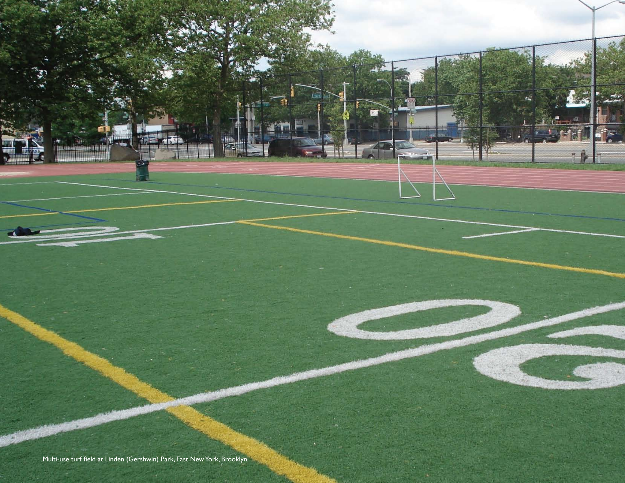
Multi-use turf field at Linden (Gershwin) Park, East New York, Brooklyn