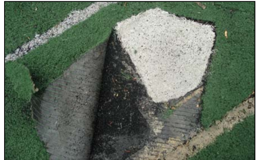
Loose seams result in near-detachment of turf in Baruch Park, Lower East Side, Manhattan

In 2008, 35% of fields were impacted by loose seams, and by the summer of 2009 that percentage had risen to 42%. Loose seams create trip hazards and contribute to field deterioration.